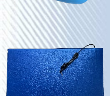
ORDER CODE MED-04FP PRICE £61.00 (£73.20)